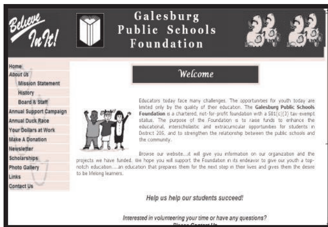
Foundation's new website home page

This year the Foundation took another step in helping provide our donors and supporters with more information by setting up a web-site. Our new web address is: www.gburgpsf.org .